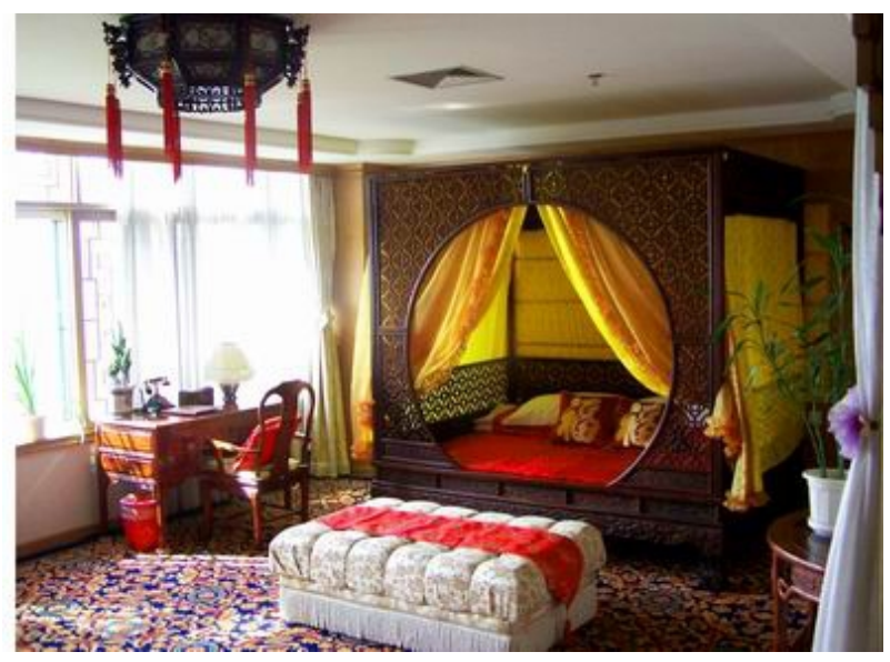
View of Longmai SPA