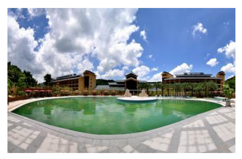
View of Dipai Hot Spring Resort